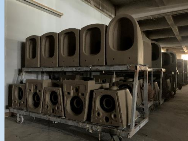
Wet Clay Body