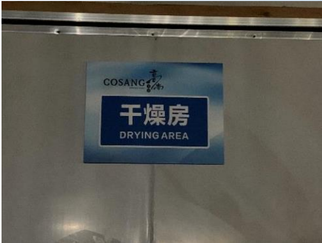
Constant Temperature & Humidity