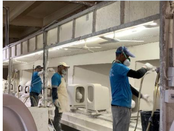
Dry Glaze=Powder Glaze