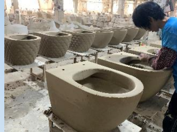
Clay Body Casting