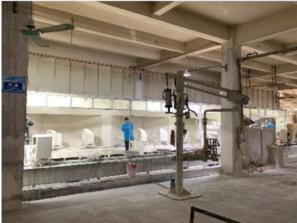
360 Circle Glaze Line