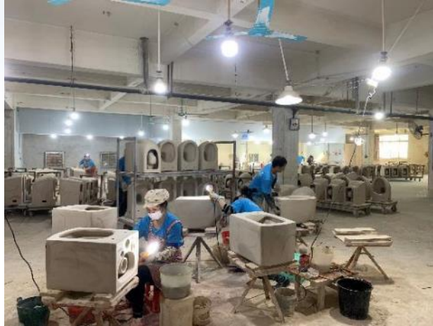
Dry Clay Body Fettling