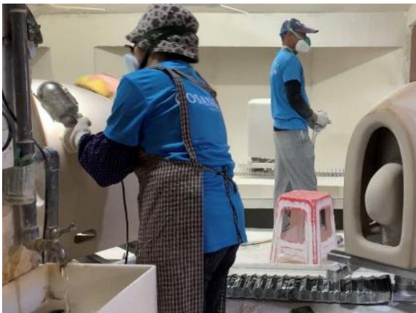
Clay Body Final Inspection