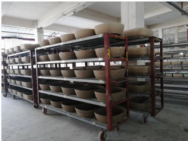
Basin Clay Body