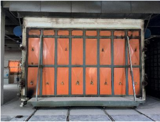
1 st Kiln