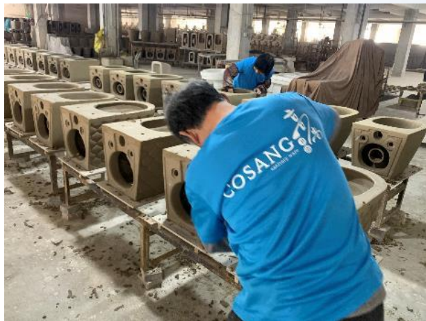
Clay Body Fettling