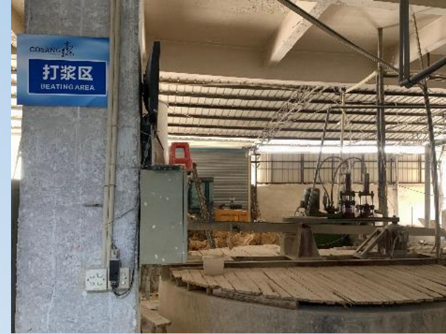
Clay Crush & Mix